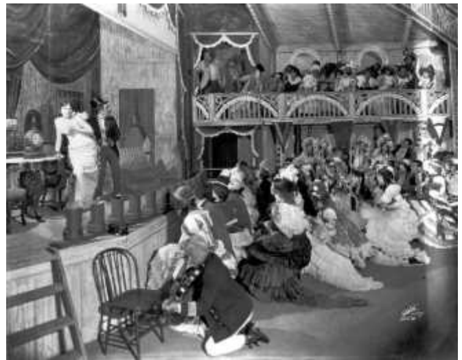
Scene from original 1927 production of Show Boat