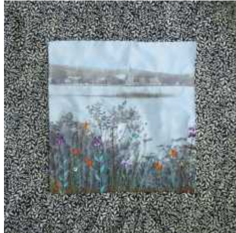
Sharon Gallagher 'Turtle Pond'

In this project Kantha stitching forms the basis of many of these pieces. Many of these items can be seen on display under the glass tops of the tables at Que de Bonnes Choses, Main Road, Hudson