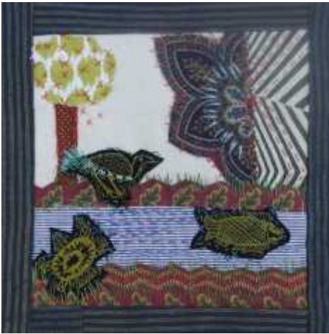
Carol Outram 'Sandy Beach Woods'