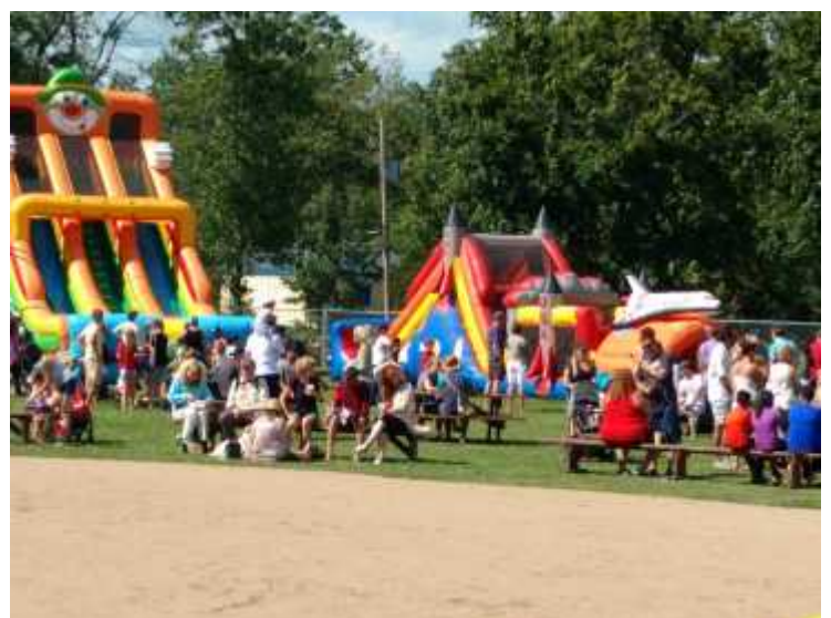
Hudson Street Fair 2017, left Main Road, right St. Thomas Park