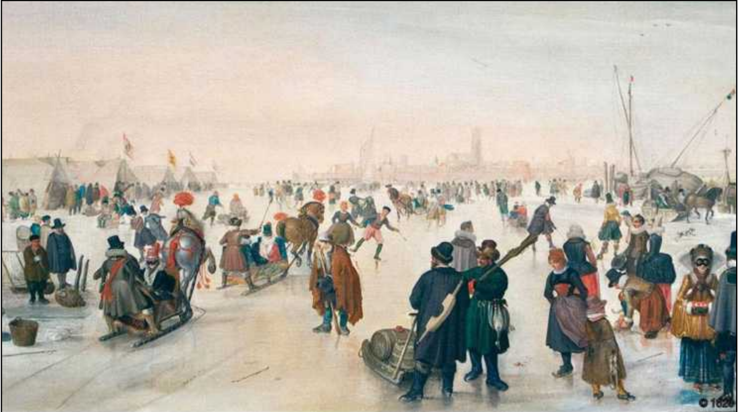
Random Art: Winter Scene on a Frozen Canal by Hendrick Avercamp