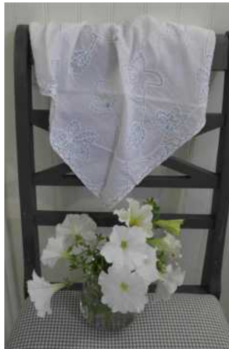
Classic paisley bandanna by Carol Outram with hand stitched detail