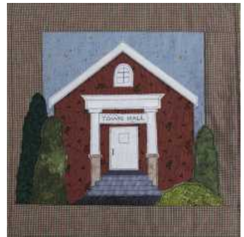
Phyllis Spriggs 'Hudson Town Hal

As a homeless organization, we are very aware and concerned about transportability. There are few places in Hudson to hold an exhibition of work for more than three days. So, we decided to create a portable Gallery. The concept is to design and make a series of stitched scenes, each reflecting our personal view/impression of an area in the village of Hudson. Working from an idea, feeling, photograph, old picture etc. of a location in Hudson we designed and stitched a number of pieces from fabric scraps, kantha and creative stitching, as well as mixed media.