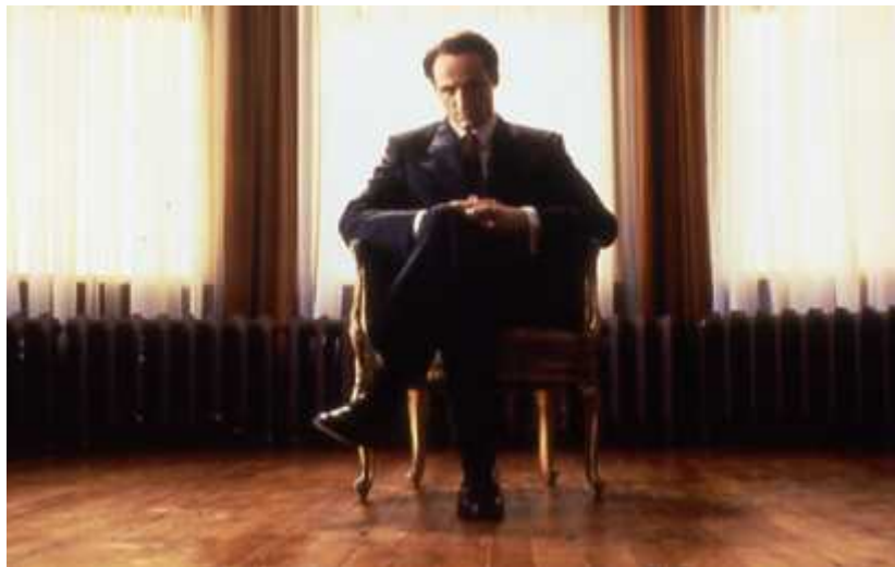
From 32 Short Films About Glenn Gould

"We are thrilled to be working with TIFF on our shared mandate to unite the nation through film. This partnership between our two Canada 150 Signature Projects helps to ensure every Canadian has the chance to discover and appreciate great Canadian cinema on National Canadian Film