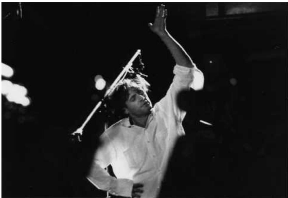
From 32 Short Films About Glenn Gould

Join us on April 19, 2017 and Celebrate Canada by watching a Great Canadian film!