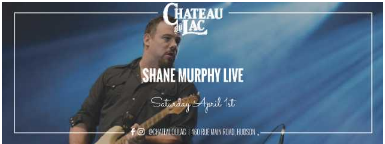
Saturday, April 1, 9:30 pm - $8.00 online, $10.00 at the door; chateaudulac.ca

Various cultural activities at Le Chenail Cultural Centre on an island in the Ottawa river in front of Hawkesbury. Check on our calendar of events and at the Le Chenail website, lechenail1975.com .