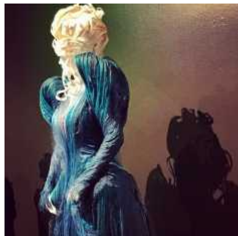
Meryl Streep costume from 2013 Disney movie of the musical "Into the Woods."