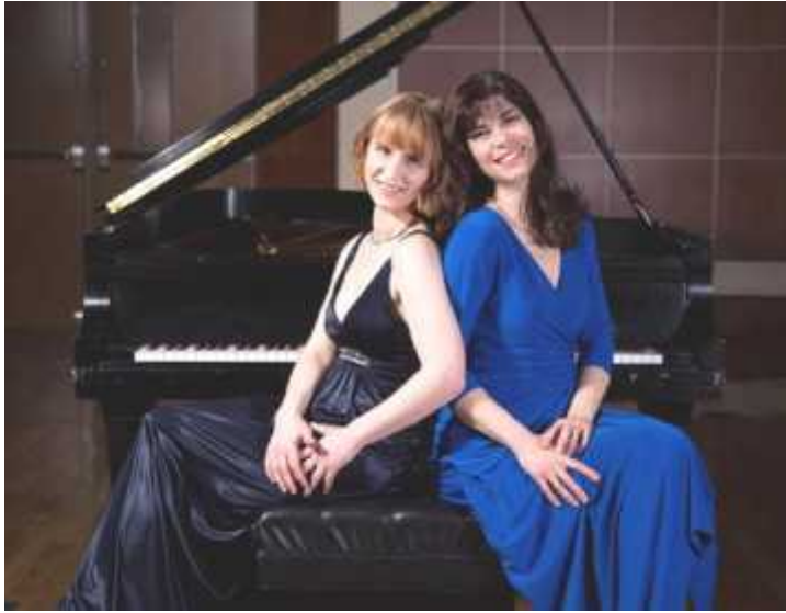
Chamber Music, the Duo Estrella April 9th, 4:00 pm at St. James Church Hall.