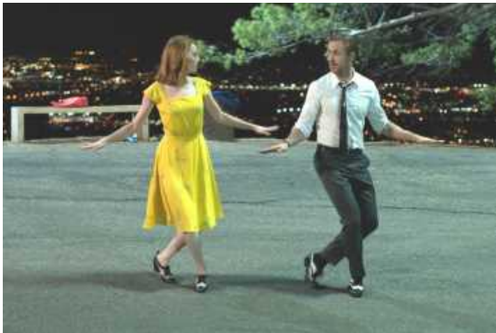
La La Land Monday, April 17 at Village Theatre, 2:00 pm and 7:30 pm